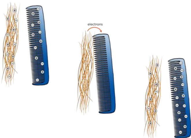
The plastic in the comb attracts electrons more than the hair, and when you comb your hair, friction causes electrons to be rubbed off the hair and onto the comb.

Material objects are made of atoms, which means they are composed of electrons and protons (and neutrons). Objects ordinarily have equal numbers of electrons and protons and are therefore electrically neutral. But if there is a slight imbalance in the numbers, the object is electrically charged.