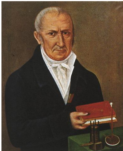
Alessandro Volta (1745 –1827), whom the volt is named after. Volta is credited with inventing the battery and discovering methane.