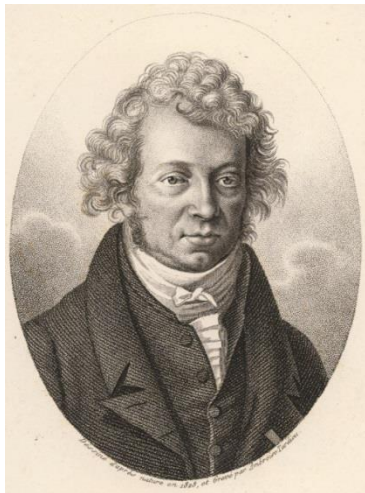
André-Marie Ampère, whom the unit of electric current is named for.